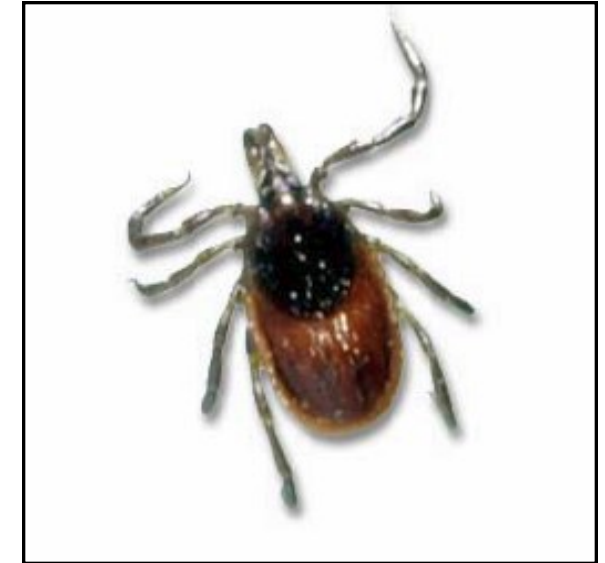
Deer Tick—Adult Female Diameter—Less than 1/8 inch