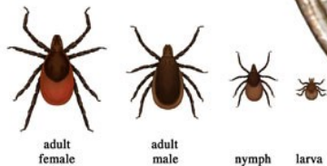
Blacklegged Tick ( Ixodes scapularis )