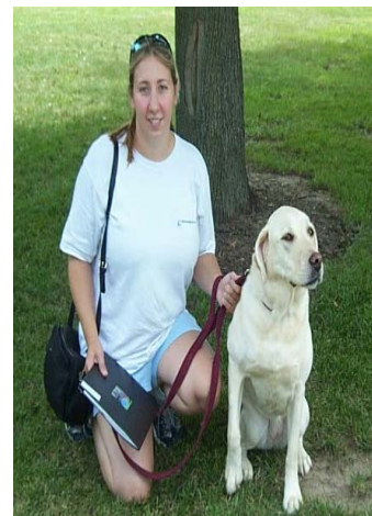
Daisy was adopted by Sunrise Assisted Living of Gurnee. The residents bonded instantly with Daisy. Daisy helps the residents get their exercise with daily walks and even Frisbee games. Daisy loves the attention. The residents are grateful to have Daisy as their new friend.