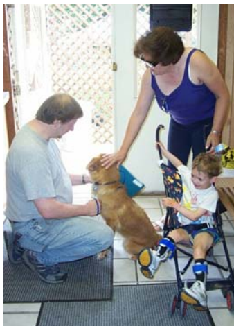
This family visited us during our Summer Adoption Festival in June. They brought their young son in to look at our adoptable dogs. Their son connected instantly with a sweet golden lab mix named Lacey. Everyone enjoyed the interaction between this family and their new pet.

100 Years From Now it will not matter what my bank account was, the type of house I lived in, or the kind of car I drove, but the world may be different because I was a volunteer.