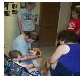
Staff and volunteer adoption counselors share and gather information to ensure a good fit.