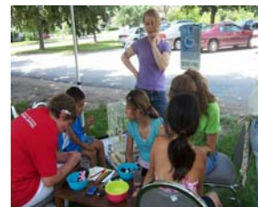
Children who visited our Summer Adoption Festivals enjoyed having their faces painted by members of our Volunteer Teen Corps.

To the Staff of the McHenry County Animal Control: